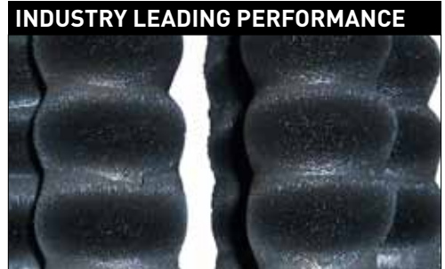
Contamination attached to the 9,000 Gauss magnetic cores